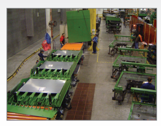
Tow Line Assembly Process