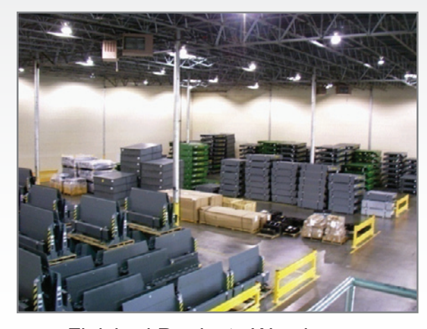
Finished Products Warehouses