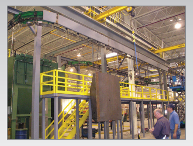
Overhead Conveyor Lines