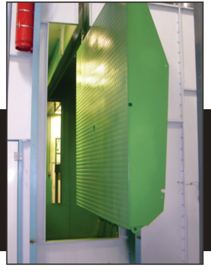
Automated Primer / Finish

600 Orwell Street, Unit 6 Mississauga, Ontario, Canada L5A 3R9 Tel: 1-877-316-6557 Fax: 1-905-276-6512 email: sales@4FrontES.com www.4frontes.com